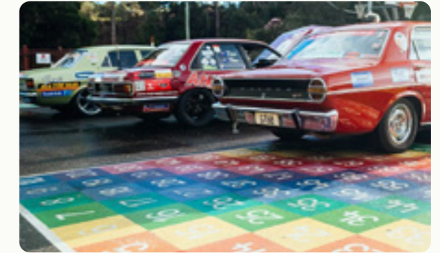
Aussie Muscle Car Run