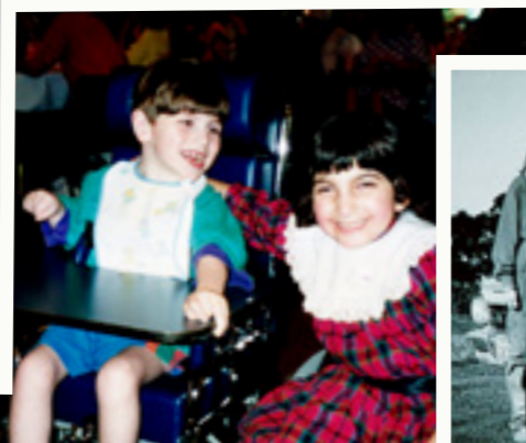
1985 Kids Christmas Party