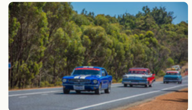
Creative Car Cruise