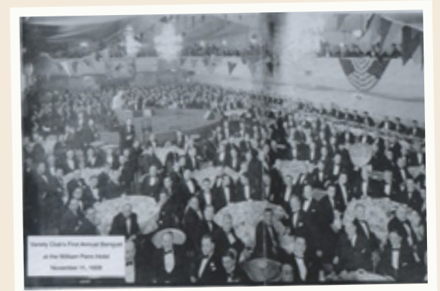
Variety's First annual banquet at the William Penn Hotel, 1928