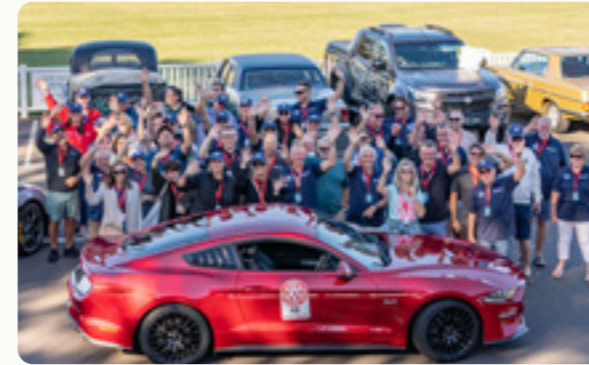
Rally Around Victoria