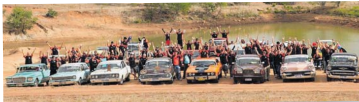
Participants in a previous event.