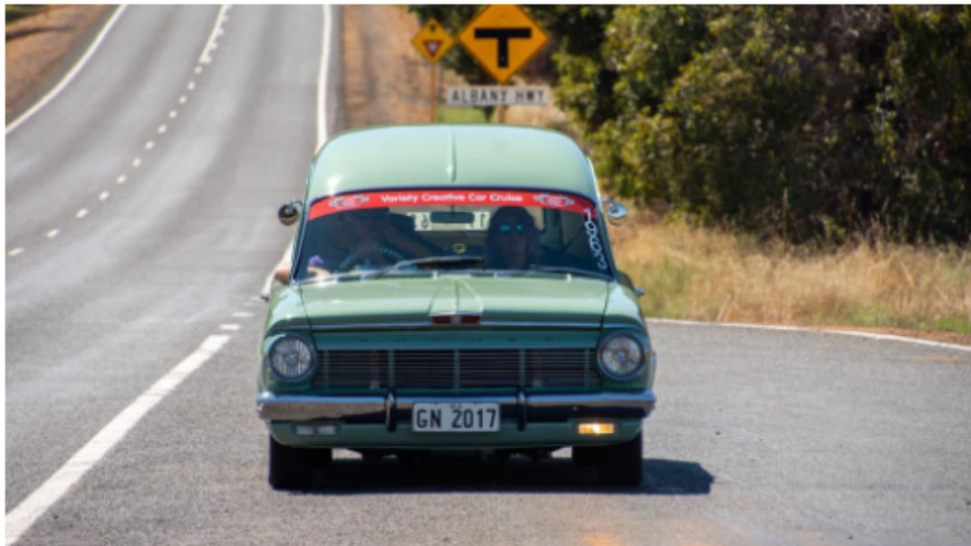
Last year's Variety Creative Car Cruise.