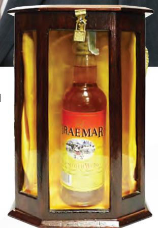
THE MILLION DOLLAR BRAEMAR SCOTCH BOTTLE