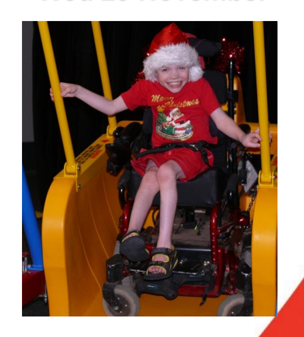
Wed 29 November