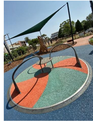
Variety Livvi's Place Taree

During 2020, our Just Like You program was delivered in person (pre COVID) to 8,323 primary school children in Sydney and Newcastle by presenters with disabilities, with a new streamlined physical and online program now developed and trialled that will extend our reach further in 2021.