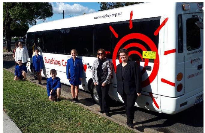
Grafton Public School May 2020

We opened a new Variety Livvi's Place inclusive playground in Taree and new inclusive play spaces within Stockland Retail centres in Shellharbour and Merrylands, with Stockland Cairns to follow later this month. The Stockland Edgebrook residential development opens its inclusive playground on 18 December with new playgrounds scheduled for Glenfield to open in March and construction to commence in Liverpool at the same time. We have over 14 active Council and Stockland led projects in the inclusive play pipeline at present.