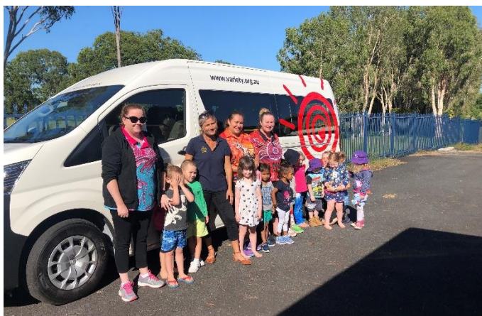
Jumbunna Community Preschool March 2020

Additional deliveries approved in FY2019 and delivered during the 2020 Financial Year included vehicles for Trundle Central School, Jumbunna Community Preschool and Early Intervention Centre, Blind Sport NSW, Chromehurst School, Bates Drive School and Grafton Public School while two coaches delivered to Jamison High School and Lucas Heights Community School were approved and delivered during the FY2020 year. An outstanding accomplishment (that also highlights the issue we regularly face around year-end grants liabilities raised in my earlier comments).